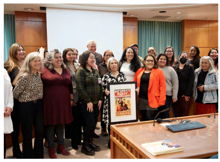
RFDC grantee Bold Futures NM and other members of the Reproductive Healthcare Success Project with Governor Lujan Grisham

In 2022, Bold Futures was also able support legislation, public education, and community organizing around two bills, prohibiting public entities from creating barriers to reproductive health care services for individuals and adding gender affirming care to the definition of reproductive health care, and develop a Reproductive Healthcare Success Guide as a community-led resource for care providers in the state.